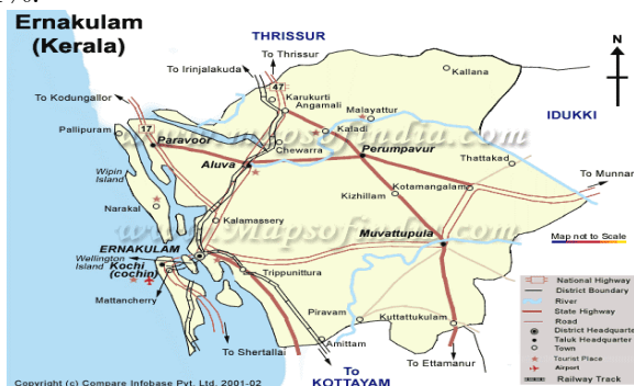
Fig.1 Ernakulam District Map

The district covers an area 3068 km 2 and located on the western coastal plains of India. Ernakulam district is bestowed with all the geographical factors, which help the development of industry, and it is in the vanguard of all other districts in Kerala in the field of industry. The availability of all types of transport facilities viz., road, rail, canal, sea, air is a factor which is unique to this district. Ernakulam is the biggest commercial center in the state of Kerala. Its M.G. Road is the location of some of the biggest businesses in Kerala. This district is listed as the "most advanced" district in Kerala. The construction sector in Kerala helps to increase the GDP at the rate 10-11%.